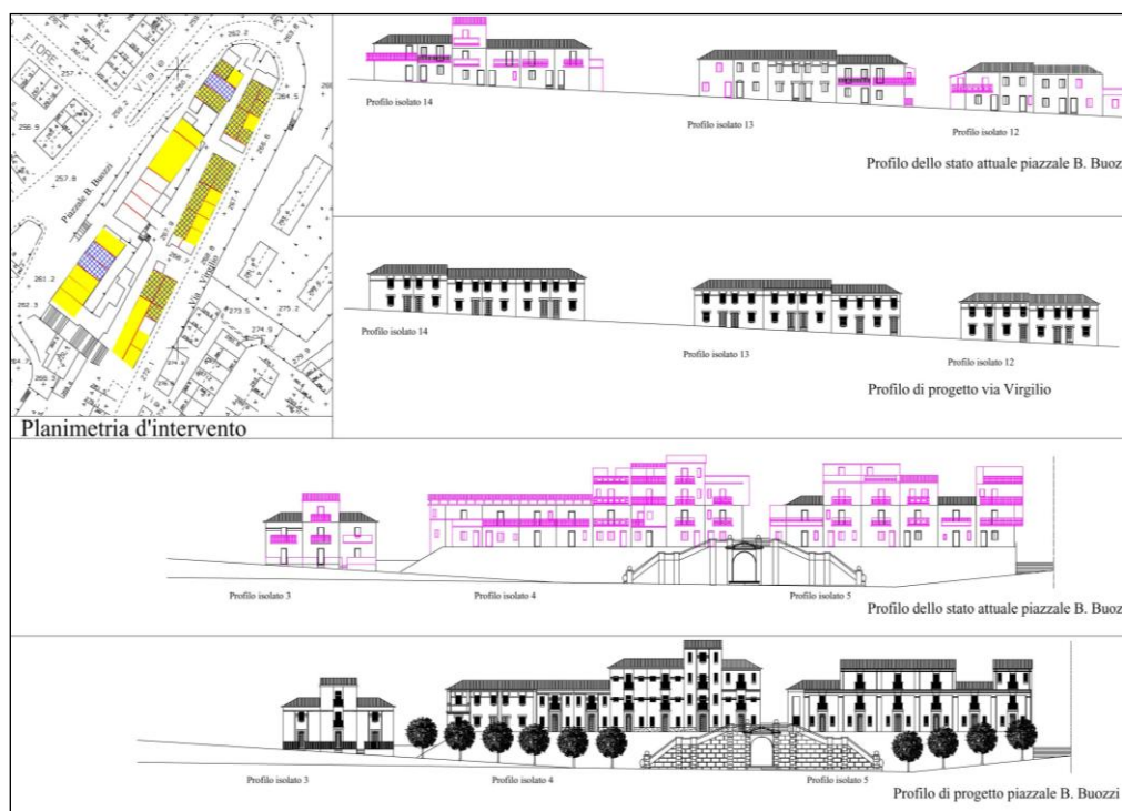
Figure 3 – Urban project “Piazzale B. Buozzi”