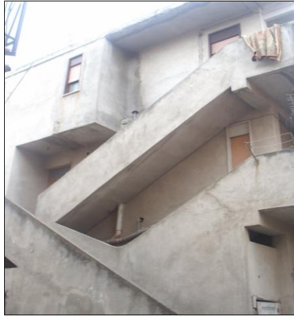
Figure 2 – Unauthorized interventions