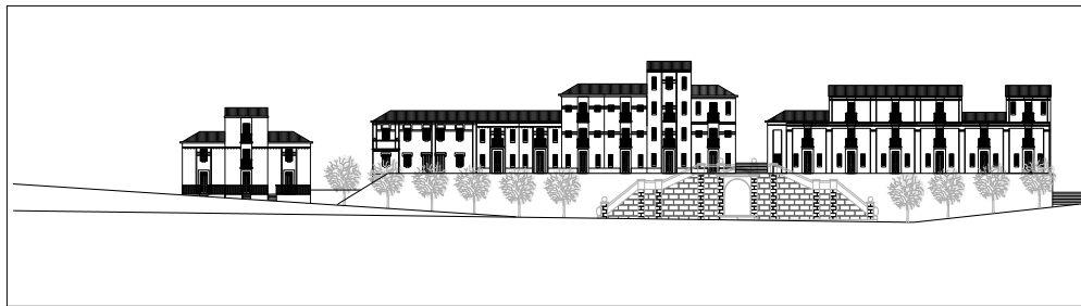
Figure 4- Urban project "Fontana muta"